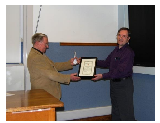
[with many thanks to Rhian Kendall for preparing the scroll]

Following a joke about a Welshman marooned on a desert island, Alun concluded with his observation that the future of the Group is in good hands.